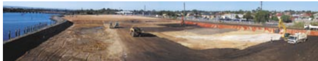
Above - Construction now underway at the Newport Quays Edgewater site. Below - Artist's impression of how Edgewater will look when construction is complete.

Coinciding with the commencement of site works was the release of The Shores, Edgewater's final release. The Shores, which has already received huge interest has 46 one, two and three-bedroom apartments, a select number of marina berths, and is also home to the exclusive Edgewater Club, which includes a lap pool, spa, sauna and state-of-the-art gym for exclusive use by Edgewater residents.