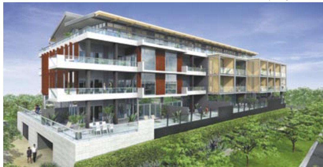
The Sails (above), and Park Villas at Edgewater