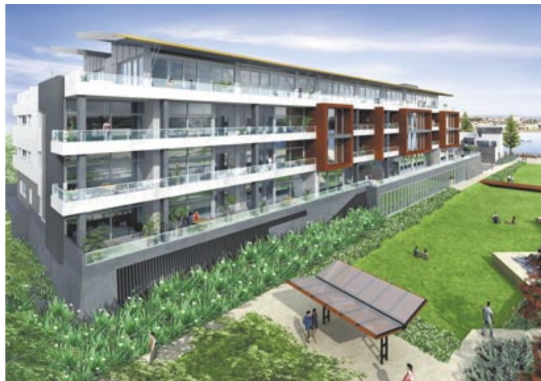
The Shores at Edgewater