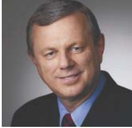
Mike Rann Premier of South Australia

Port Adelaide is Australia’s last major port to be redeveloped, and the project will bring thousands of jobs and residents to the area.