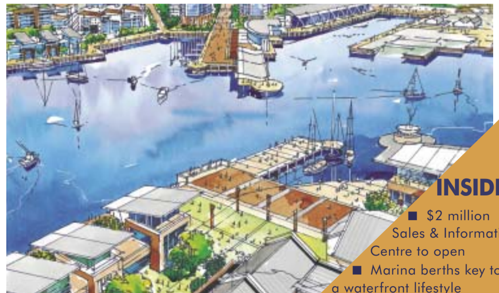
An artist's impression of Newport Quays from historic Harts Mill. The development combines the best of waterfront residential design and urban planning to provide a world class living environment for residents.

Add to that, the energy of an active inner harbour framed by marina berths for both private and public use, and Newport Quays will be the ultimate in harbour-side living.