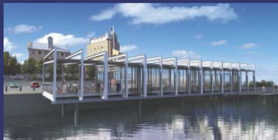
The new Newport Quays sales and information centre is located at the end of Mundy Street (turn off St. Vincent Street, Port Adelaide).

Port Adelaide's long list of existing attractions and facilities continues just outside the boundaries of Newport Quays. Major shopping centres such as West Lakes, cinema complexes, beachside attractions including Semaphore and North Haven and leading restaurants add to the array of activities a Newport Quays lifestyle offers.